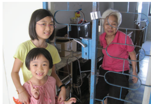
Visiting our beneficiaries and giving out goodies