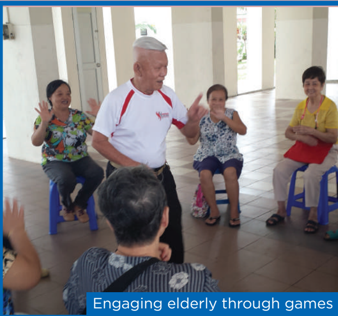
Engaging elderly through games