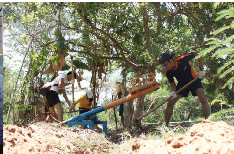
Building an irrigation channel for planting

W.A.D! Club believes that proactive volunteerism can be the next big youth trend in Singapore. This year, the National Youth Council's has agreed to sponsor W.A.D! Club's #VforVolunteer programme. This programme covers sports, leadership mentoring, community work and research. It aims to radically change the way youths view volunteerism.