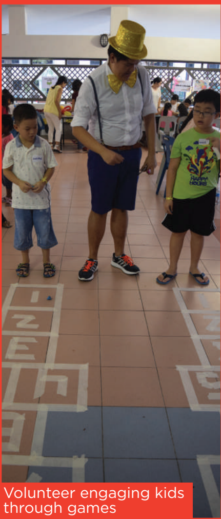
Volunteer engaging kids through games