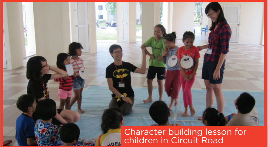
Character building lesson for children in Circuit Road