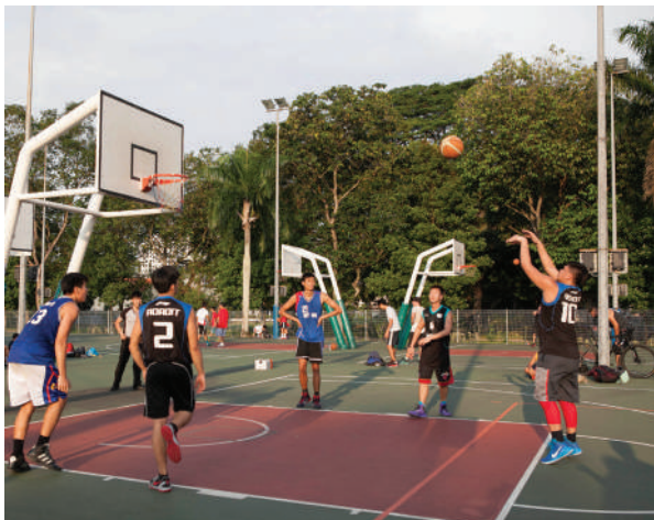
Basketball games at Co-Curriculum Activities Branch (CCAB)