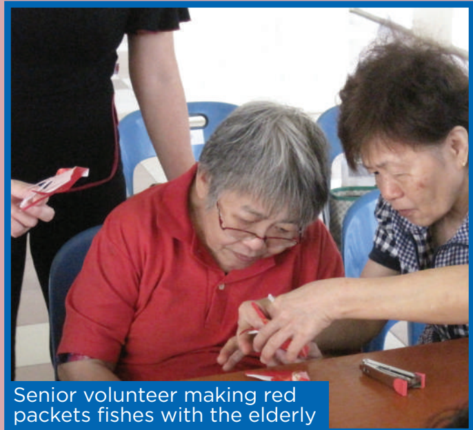
Senior volunteer making red packets fishes with the elderly