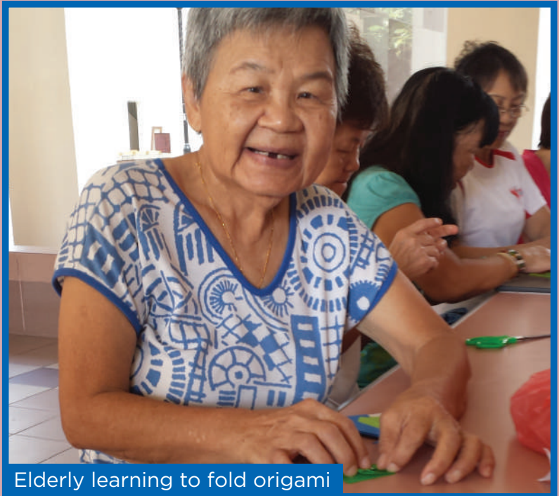
Elderly learning to fold origami