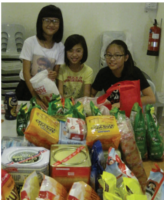
Donation of food item by the students

At SPARKS student Care Center, we believe that each child has the ability to give and contribute to the community. Hence, our Values in Action program was started to cultivate each child to be a concerned citizen, rooted in Singapore. We seek to nurture each child to have a strong sense of civic responsibility, who actively participates in improving the lives of those around him.