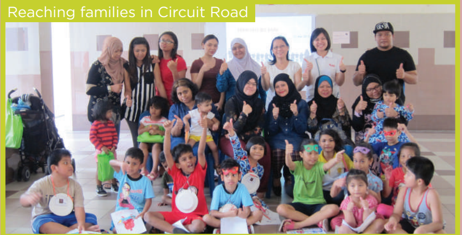
Reaching families in Circuit Road