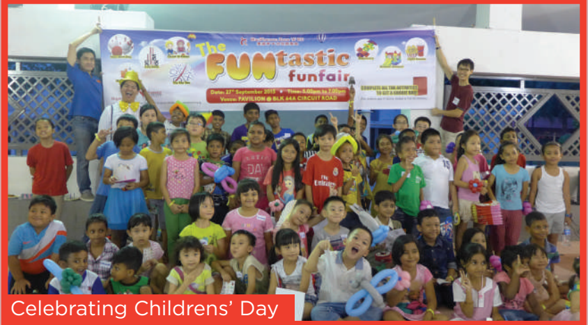
Celebrating Children's Day