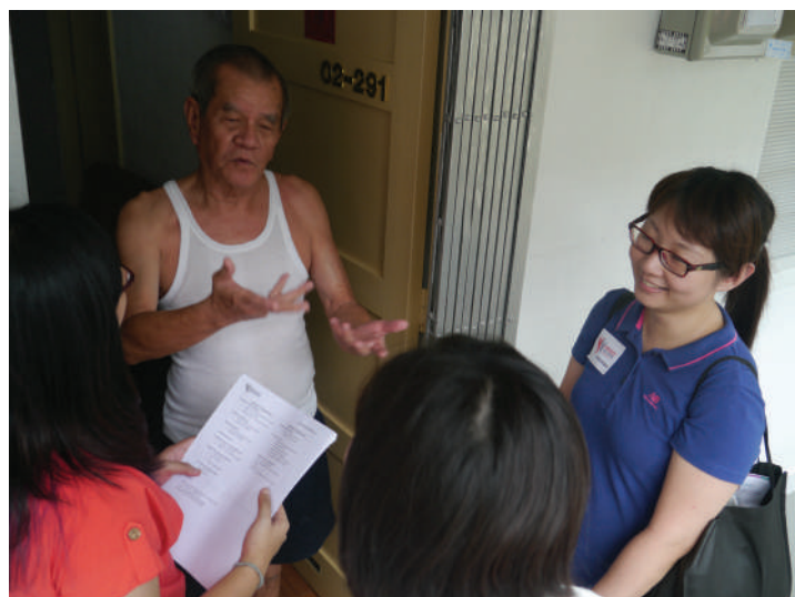
Volunteers taking time to converse with the elderly