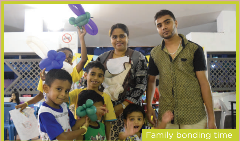
Family bonding time