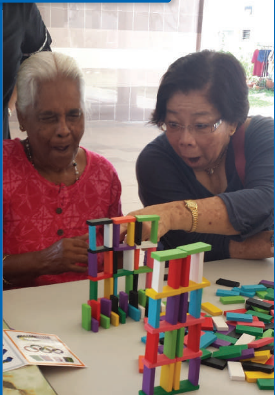
Senior volunteer building domino with elderly