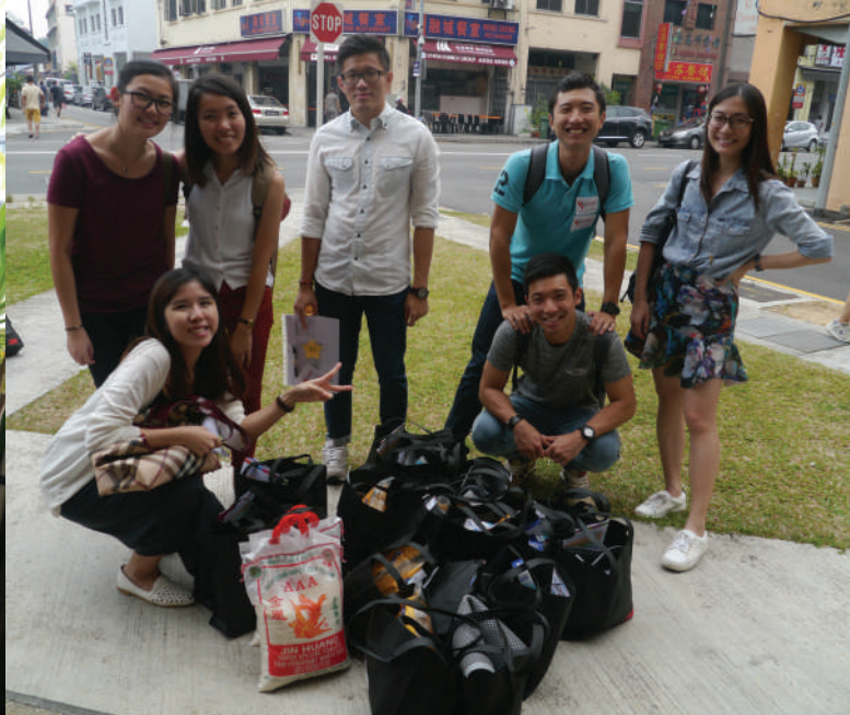
Volunteers handing out goodie bags during festive seasons

Other outreach activities include providing aid in the form of house revamps, distribution of healthcare products and distribution of goodie bags during festive seasons, by the young adult volunteers.